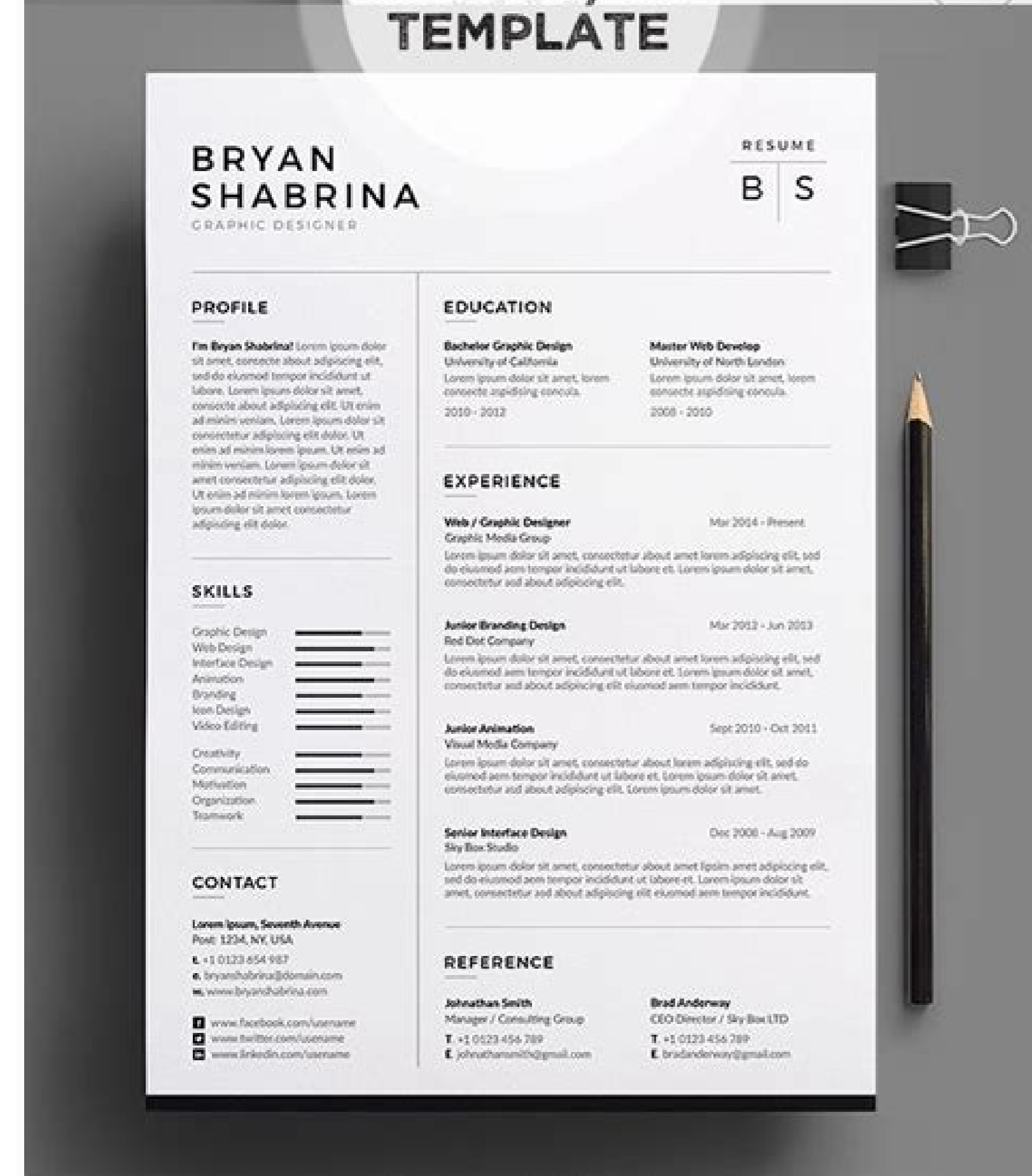
Example of a graphic designer resume. Best resume for graphic designer. Graphic designer salary greece. Best free word resume templates. Free graphic designer resume template word.